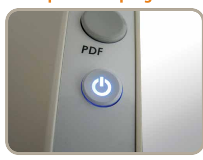
Function button design for Scan, OCR, PDF and Email