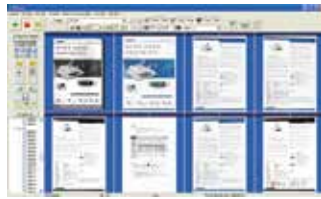
The AVScan X main screen

-The Intelligent Document Management Tool