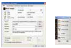
The Button Manager V2 main screen

Button Manager V2 makes it easy for you to scan and send your image to your favorite destinations with a press one button. Now the new version comes with an innovative feature to let you scan and automatically upload the scanned document to popular cloud repositories such as Google Docs, Microsoft SharePoint, or FTP. In addition, the iScan feature allows you to insert the scanned image or recognized text after optional OCR (Optical Character Recognition) process to your text editor such as Microsoft Word to get your job done easily and quickly.