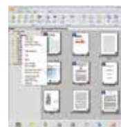
PaperPort SE 14

- The Professional Choice to Organize and Share Your Documents